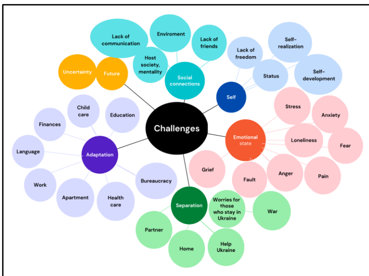
Figure 1. Main themes emerged from answers to open-ended questions