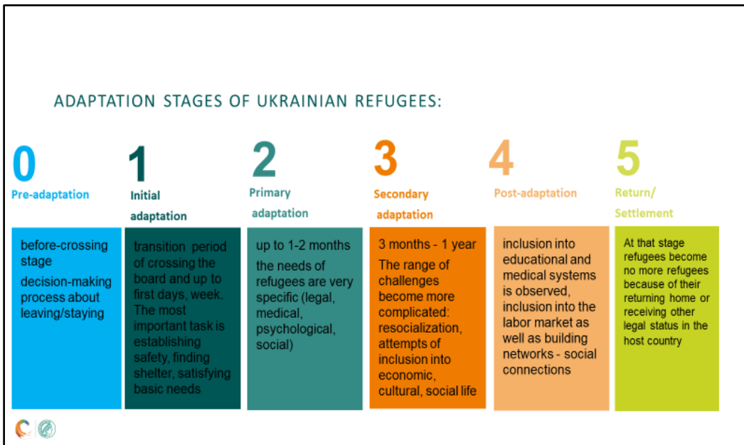
Figure 2. Model of adaptation stages and needs of Ukrainian refugees