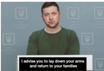
Figure 3. Volodymyr Zelenskyy deepfake

Doubling the bloody reality of a merciless war that has already displaced over 3 million people on the ground as I write, there is thus a second, (new) media war on (mis)information that redoubles the conflict online revealing the material danger of hypermimesis co-opted as a military offensive weapon with all too real effects. Putin was likely surprised by the heroic resistance led by Ukrainian president Volodymyr Zelenskyy who managed to inspire the Ukrainian army, his people, and the democratic world as a whole, both on the ground and online. Interestingly and worrisomely, one of the latest Russian attacks that redoubles the war consisted in a video simulation of Zelenskyy in which the hypermimetic technology of deepfake was put to military use to declare a simulated surrender intended to facilitate the invasion on the ground.