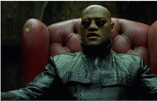
Figure 1. Morpheus, The Matrix (1999)

This genealogy of mimesis reaches indeed into the present pointing to the need to supplement a posthuman mimesis for the future as well. Cinematic blockbusters like The Matrix (The Wachowskis, 1999), for instance, already make clear that in the transition to the digital age, as the Internet cast a web of Maya on the world, the metaphysical relation between the origin and the copy, the true world and the apparent one, fiction and reality no longer holds. In the mirroring interplay between “simulation” and “hypermimesis” (Lawtoo 2015a), it is in fact no longer clear who is imitating who, via what means, and to what ends.