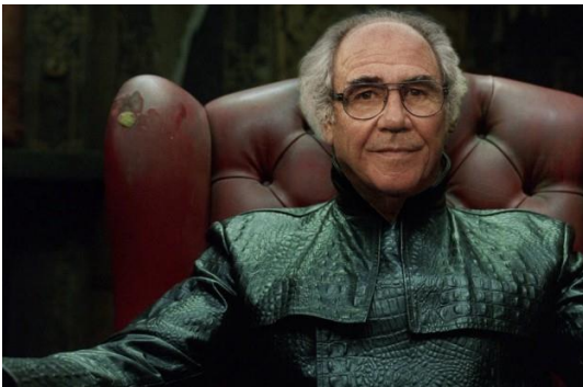
Figure 2. Baudrillard, deepfake