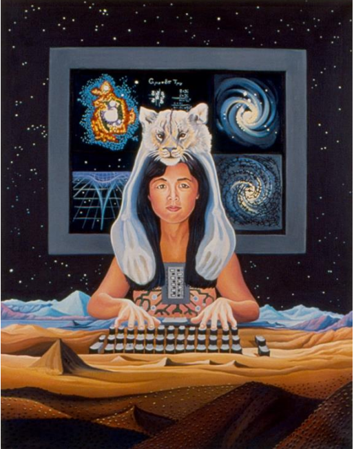
Image: Lynn Randolph — Official Website: http://www.lynnrandolph.com/painting-portfolio/?series=cyborgs-wonder-woman-techno-angels

Figure 1. Randolph, L. (Artist). (1989). Cyborg [Painting]. Online painting portfolio.