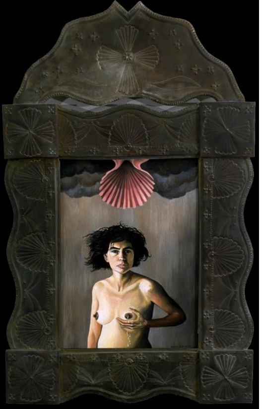
Image: Lynn Randolph — Official Website: http://www.lynnrandolph.com/painting-portfolio/?series=ilusas

Figure 3. Randolph, L. (Artist). (1997). Venus [Painting]. Online painting portfolio.