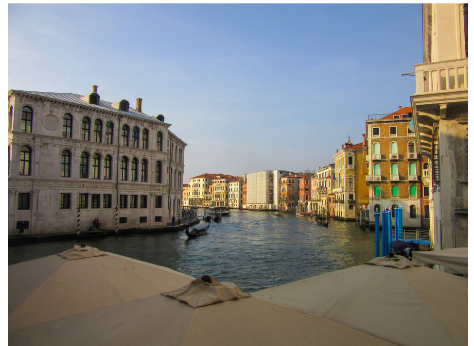
Top and above Views near Nietzsche's apartment from April 10 - June 6, 1885, Ponte Rialto, Venice.