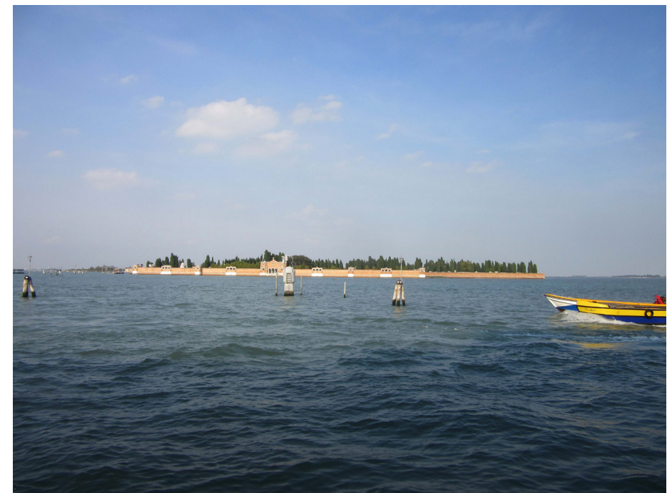
Top Near Nietzsche’s apartment at Calle del Risotto, Venice. He stayed here for three days before moving to his Ponte Rialto apartment.